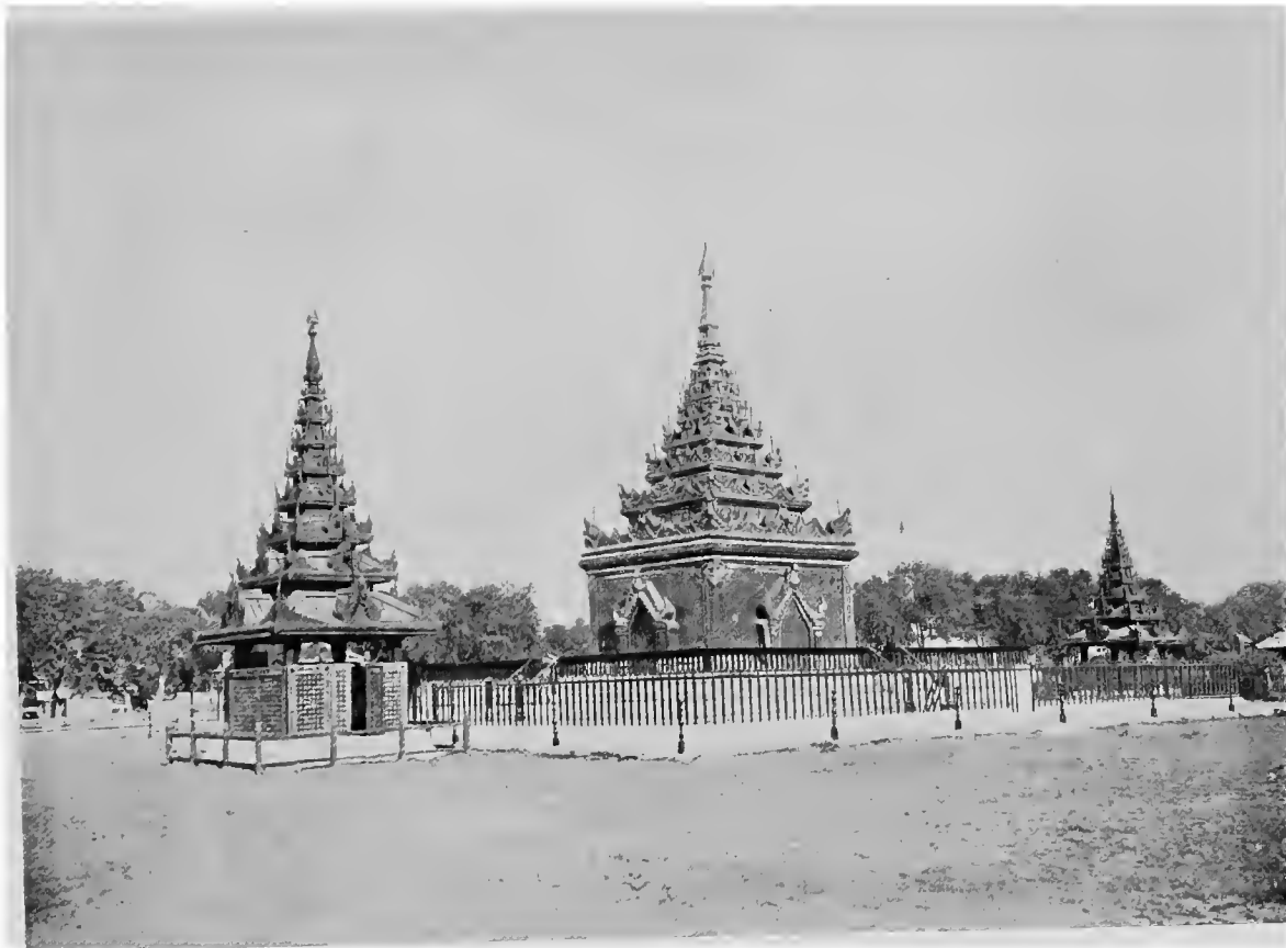
King Mindoon's Tomb, Mandalay